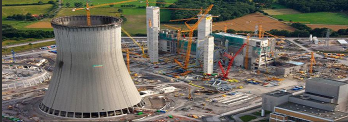
Traditional Portland concrete construction of a nuclear energy plant