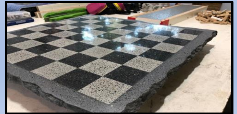
Crushed Marble Piece