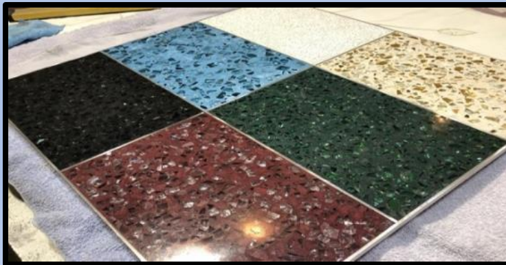
Multi-aggregate Countertop samples