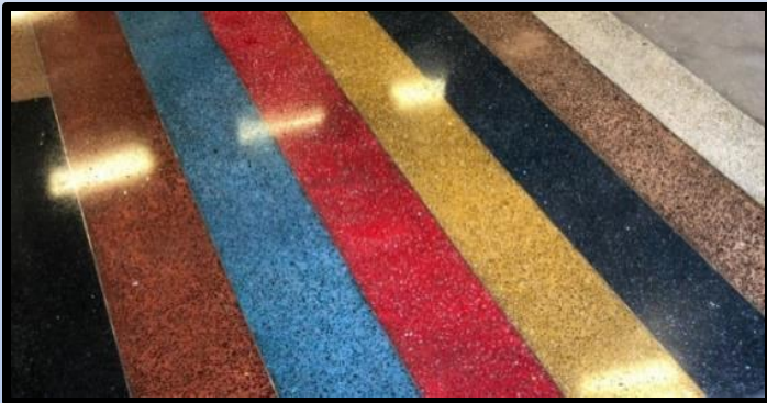
DekoCeramic Polished flooring