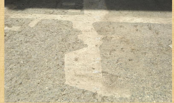
Ten-years later, no spalling, no cracking

MISSION IMPOSSIBLE: Orlando, FL. The Issue: